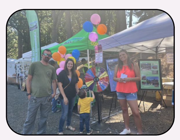
Annual Groveland 49er Festival