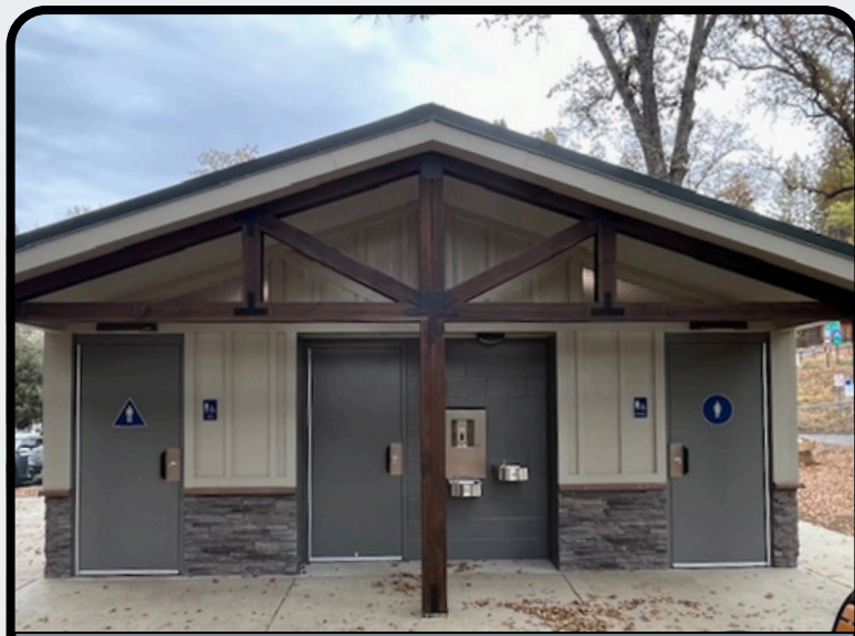
New park bathrooms, installed August 21, 2024