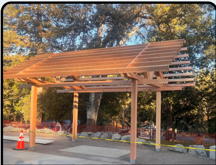
Installation of new bus structure at Mary Laveroni Park