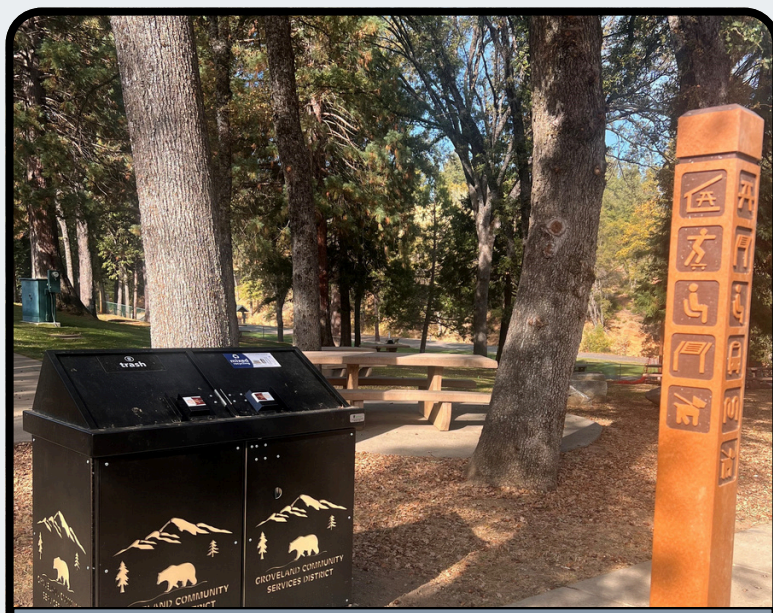
New garbage receptacles and wayfinding signs throughout the Park